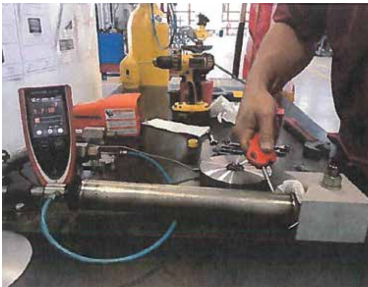
Helium Leak Tested Welds